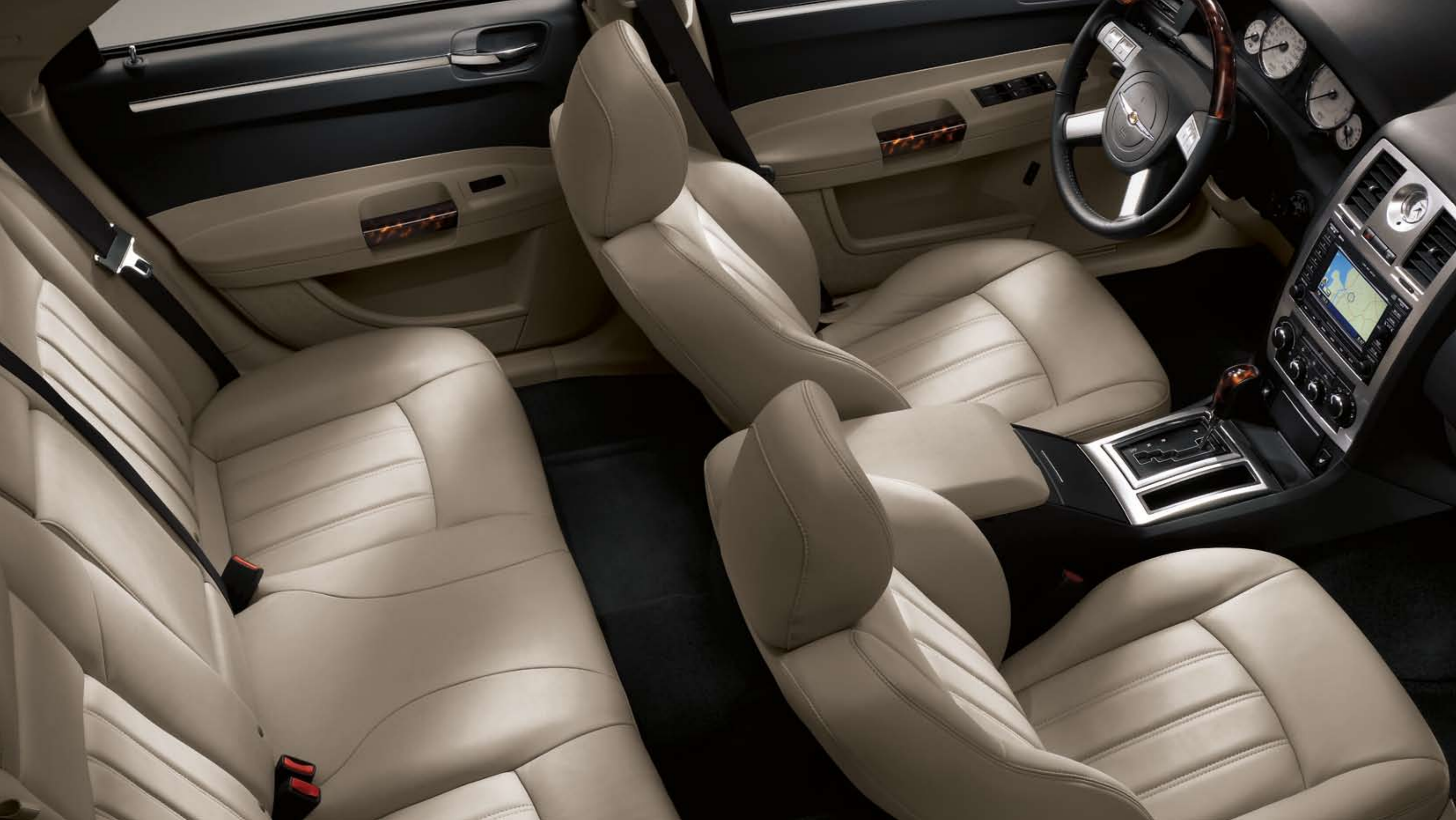
300C Light Graystone interior with Dark Slate Gray/Light Graystone trim

Bask in the available leather-trimmed seats and sophisticated interior of 300C. An eight-way power driver's seat remembers your favorite position. Durable and attractive seating fabric keeps its good looks. A large, convenient console is ready to secure small objects that need a home. An auto-dimming rearview mirror decreases night glare from drivers behind you, while available tortoise-shell-style accents add to 300C's handcrafted appearance.