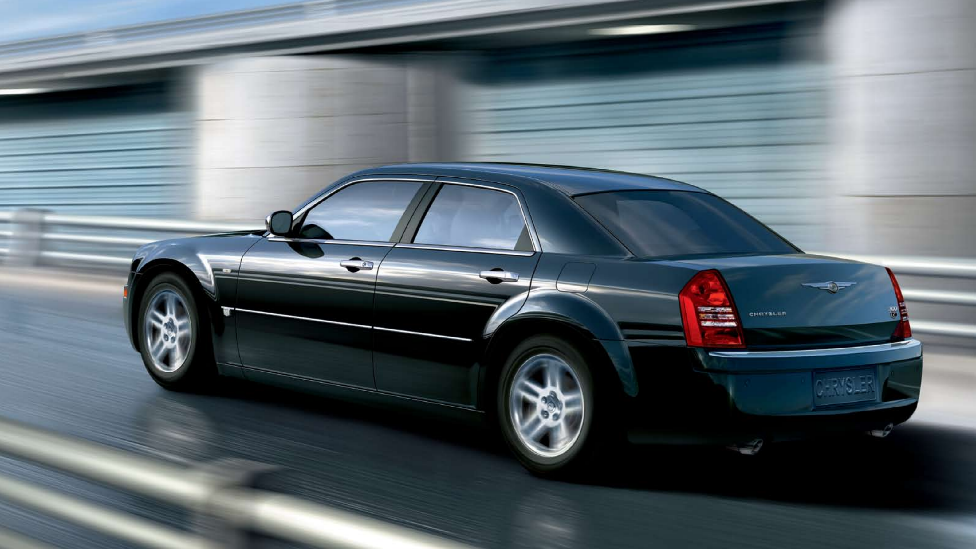
300C in Brilliant Black Crystal

One glance, and fellow drivers will be swept away as the 300C disappears down the street. Chrome power sideview mirrors and gleaming chrome clad aluminum 18-inch wheels will have made their impression. And, with the endorsement of the winged badge and the jaunty lines of broad-shouldered American good looks, the verdict will be made: 300C is an instant classic.