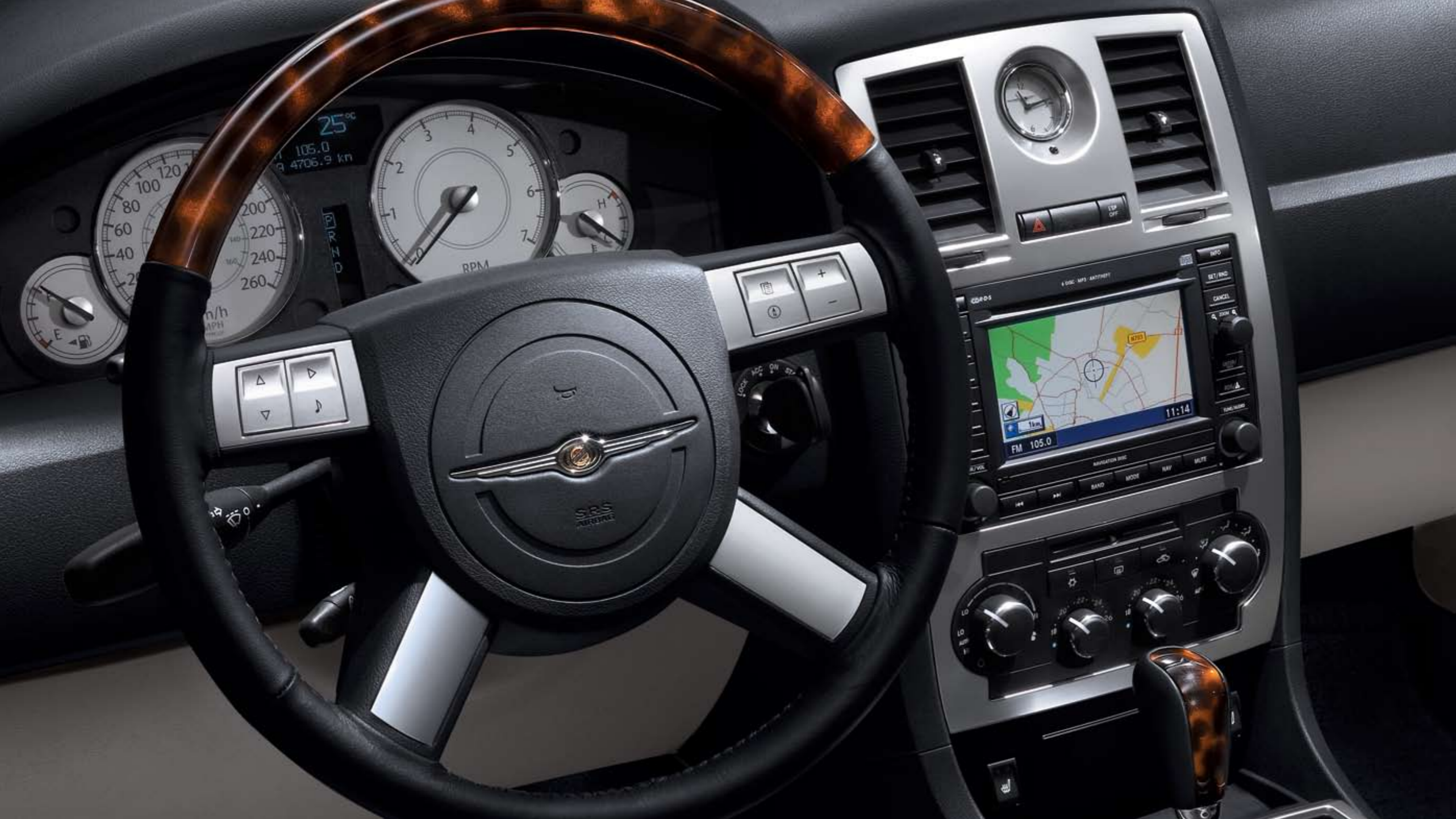
300C Light Graystone interior with Dark Slate Gray/Light Graystone trim

Power looks as good as it feels with available tortoise-shell-style accents on the shift knob, steering wheel, and door pulls. Steering wheel-mounted audio controls let you search channels safely and easily. A Boston Acoustics™ 276-watt digital amplifier puts real warmth into the sound quality of radio, CD changer, and MP3 player. The Electronic Vehicle Information Center (EVIC) lets you program and access your personal travel data, and perform other computer functions.